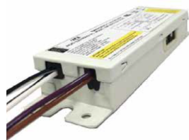
Emergency Back-up Driver & Battery Order Code: 11639